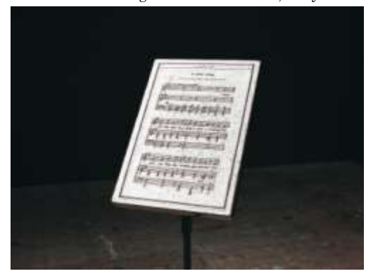
Death Song, embroidery on polyester, 2012.